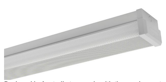
Designed in Australia to comply with the requirements of AS2293.3: 2005 and AS/NZS CISPR15: 2017